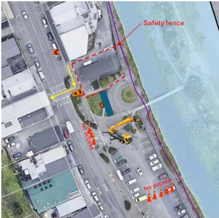
Traffic management plan 1 - Crane works/Temporary toilet installation