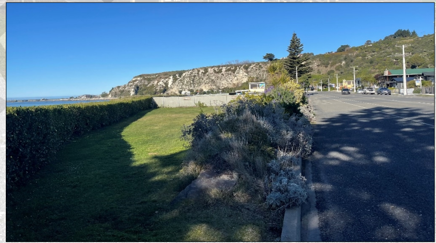
View from the Northern boundary point where the pathway stops, looking toward the old pool site