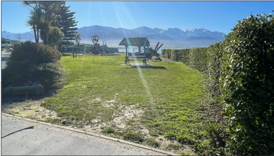
The South-East end of the Reserve looking North towards the playground and former pool