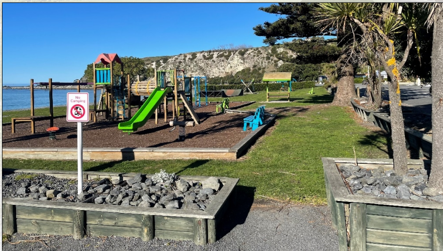
The Reserve Playground, looking towards the South-East end of the reserve