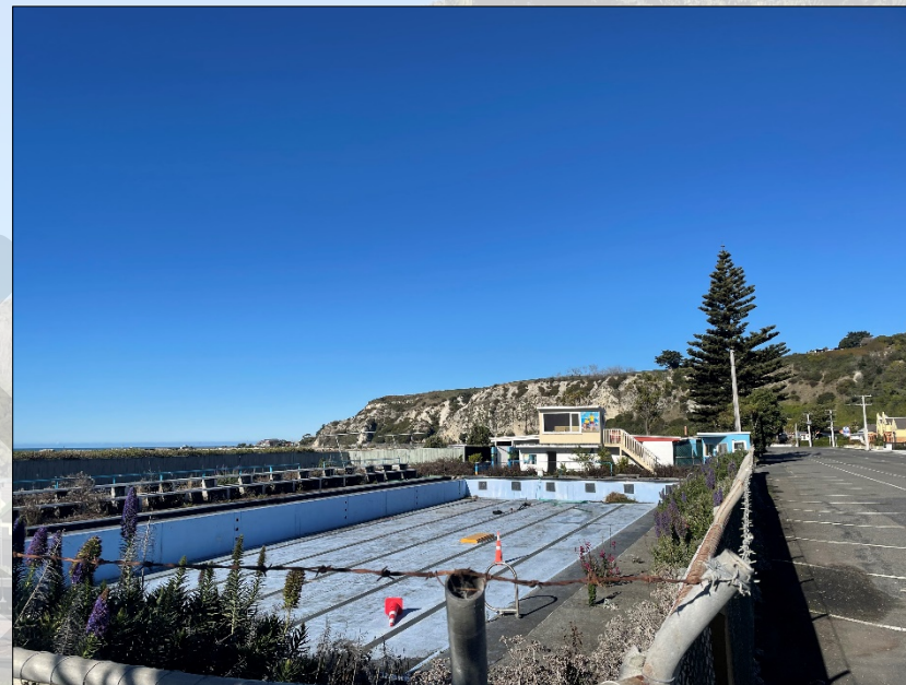
Figure 1: The former Lion's pool damaged by the 2016 Earthquake, remains unrepaired and unused in 2024.