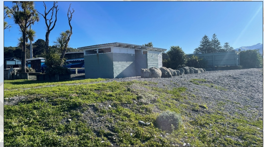
The current toilet and changing room facility from the beach/coastal environment