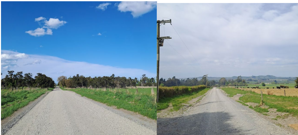
Postman's Road left Brunel's Road Right

Nigel Ross has completed the unsealed renewals programme they laid 2500m 3 of new materials on the roads and cleared the water channels, improving drainage. Works ran smoothly with little impact on the residents. The works resulted in a more resilient unsealed road.