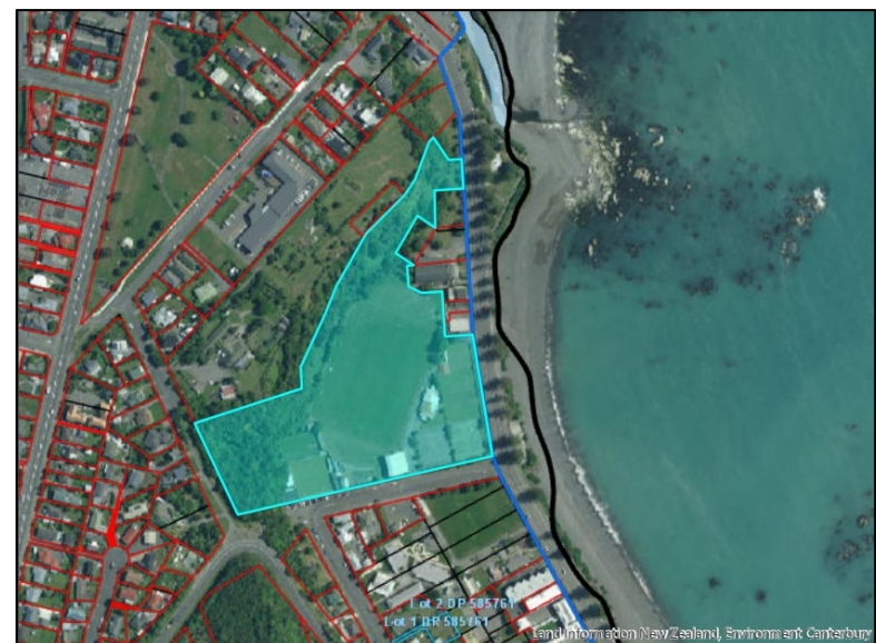
Left: Publicly available district plan maps showing the subject reserve and surrounding designations Right: Council property maps of the subject reserve